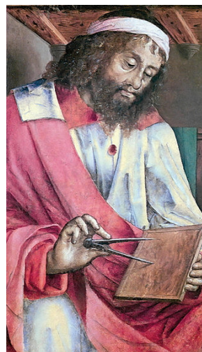
Euclid (~400 BC - ~300 BC)

For more documents like this, visit our page at http://www.teaching.martahidegkuti.com and click on Lecture Notes. E-mail questions or comments to mhidegkuti@ccc.edu .